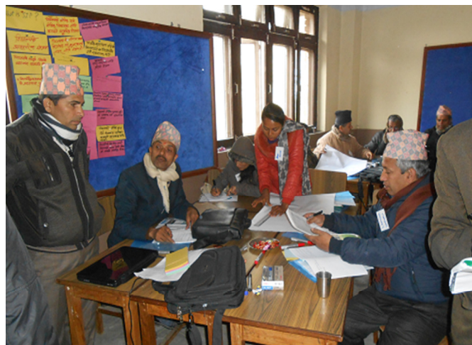
D-ToT in Rupandehi, December 2013

As the second steps of the cascade training, 5-day D-ToT was conducted in each of 4 testing districts. The D-ToT were facilitated by the district level trainers team with backstopping support from