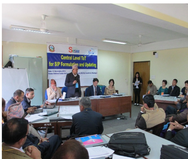
C-ToT in Sanothimi, December 2013

SISM2 Project has planned to conduct four layers of cascade training: namely, 1) Central-level of Training of Trainers (C-ToT); 2) District-level Training of Trainers (D-ToT); and 3) Resource Center-level Training (RC-T), which is the training of the key persons of the SIP Formulation Committees of each school and finally, 4) the School-level Workshop (SLW) for the SIP Formulation at school.